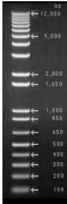
1 Kb Plus DNA Ladder 0.7 µg/lane 0.9% agarose gel stained with ethidium bromide